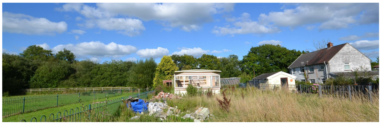
A fantastic opportunity to purchase a plot within the popular village of Trimsaran with full planning permission.

The planning permission is for a detached one-bedroom bungalow, which is located at the end of a cul-de-sac.